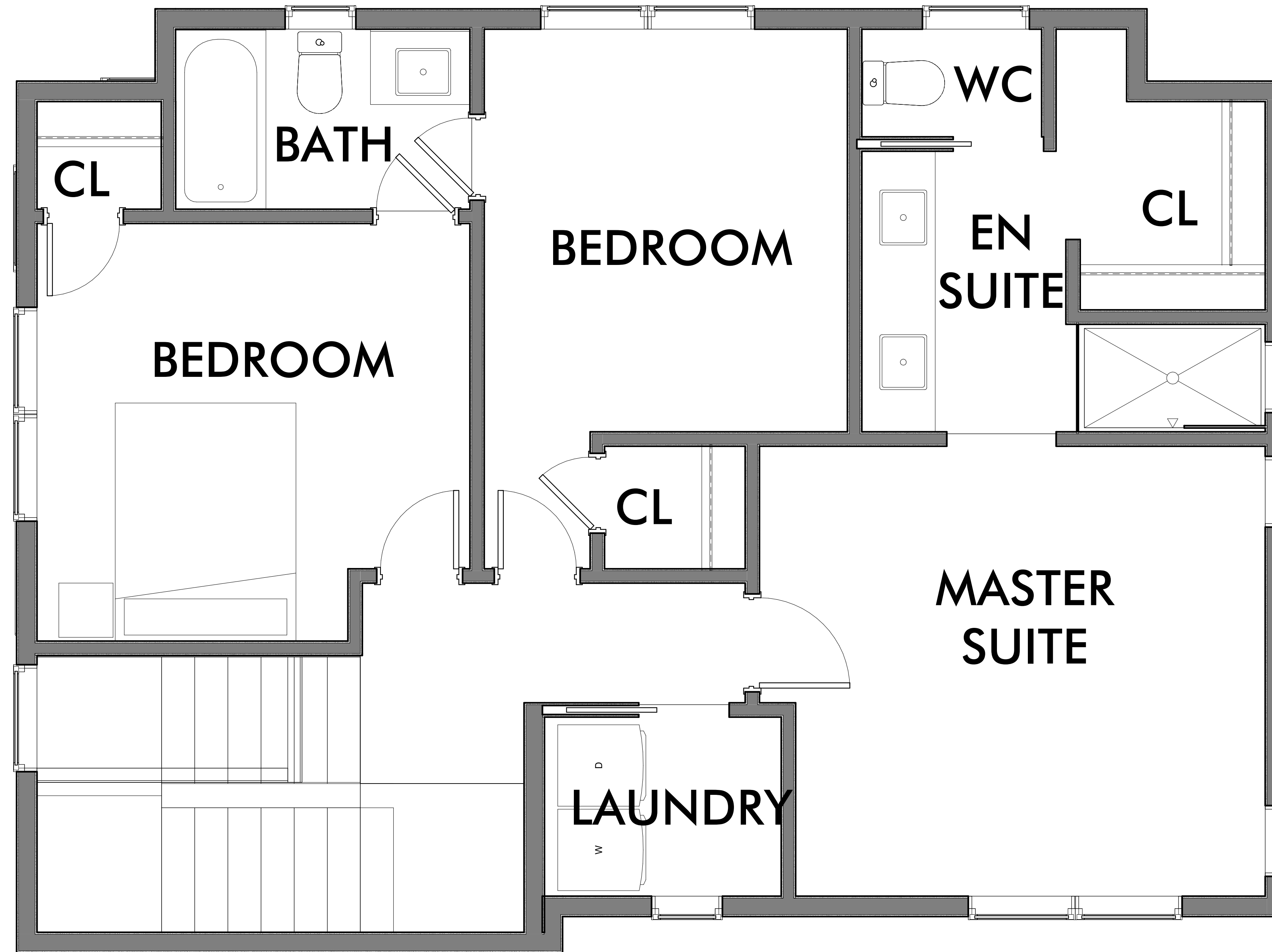
UPPER LEVEL FLOOR PLAN 1/2" = 1'-0"